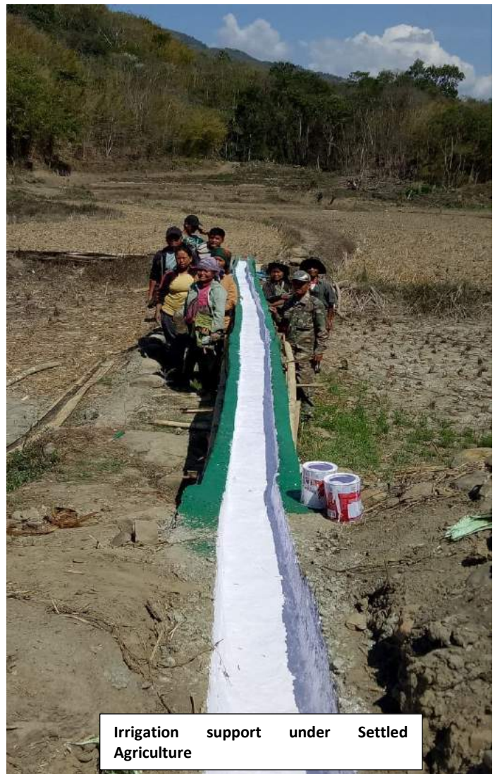
Irrigation support under Settled Agriculture