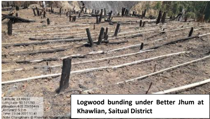
Logwood bunding under Better Jhum at Khawlian, Saitual District