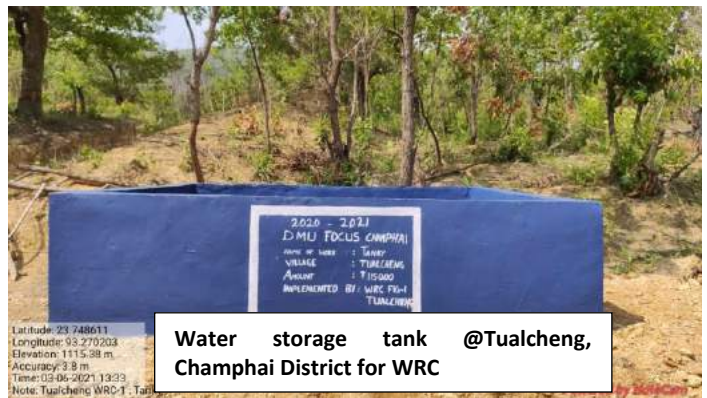
Water storage tank @Tualcheng, Champhai District for WRC