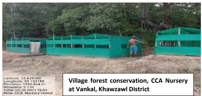
Village forest conservation, CCA Nursery at Vankal, Khawzawl District