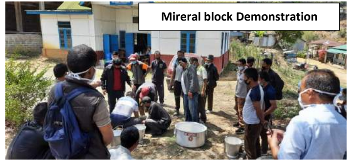
Mireral block Demonstration