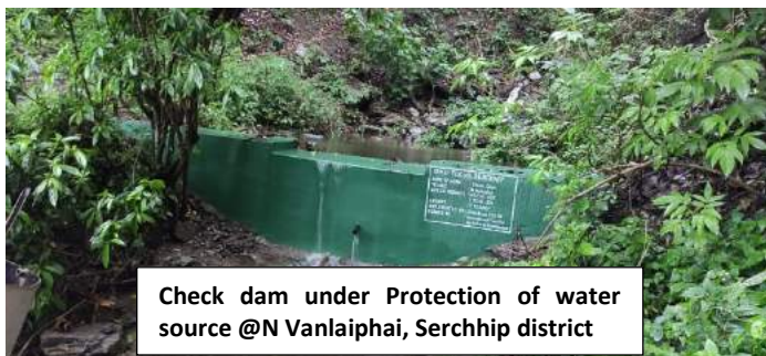
Check dam under Protection of water source @N Vanlaiphai, Serchhip district