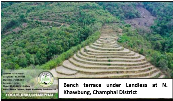
Bench terrace under Landless at N. Khawbung, Champhai District