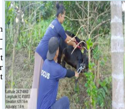
CAHW performing Ear Tagging

This activity is implemented in convergence between FOCUS Project and Animal Husbandry & Veterinary Department. The diagnostic kit for Classical Swine Fever (CSF) is under CSS where the AHVD have procured rapid diagnostic test kit and distributed to the DVOs. However, the diagnostic kits for Porcine Reproductive & Respiratory Syndrome (PRRS) are yet to be procured.