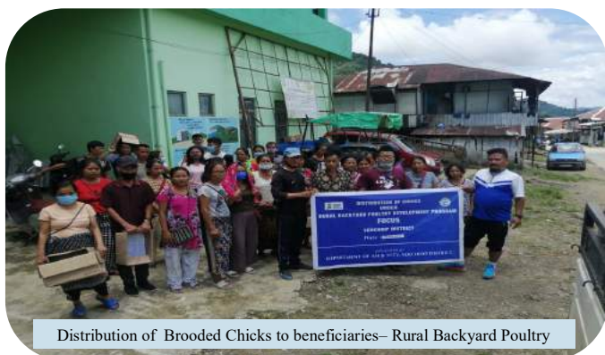
Distribution of Brooded Chicks to beneficiaries– Rural Backyard Poultry