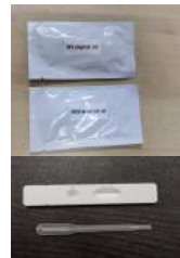
Rapid Diagnostic Test Kits for CSF

This activity is implemented in convergence between FOCUS Project and Animal Husbandry & Veterinary Department. The diagnostic kit for Classical Swine Fever (CSF) is under CSS where the AHVD have procured rapid diagnostic test kit and distributed to the DVOs. However, the diagnostic kits for Porcine Reproductive & Respiratory Syndrome (PRRS) are yet to be procured.