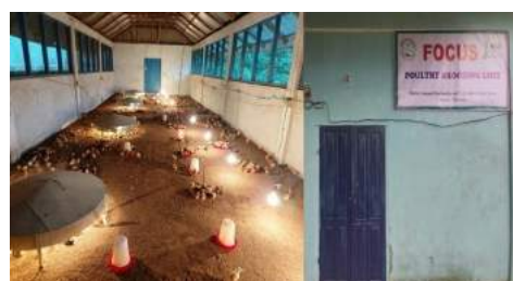
FOCUS Poultry Brooding Unit– Mamit

purpose of the Poultry Brooding Unit is the management of chicks from one day old to about 4- 8 weeks of age, and it involves the provision of heat and other necessary care during chicks' early growing period . Each identified farmer received 20 birds, feed, feeder and waterer. The Project have distributed 78600 brooded birds to 3930 households.