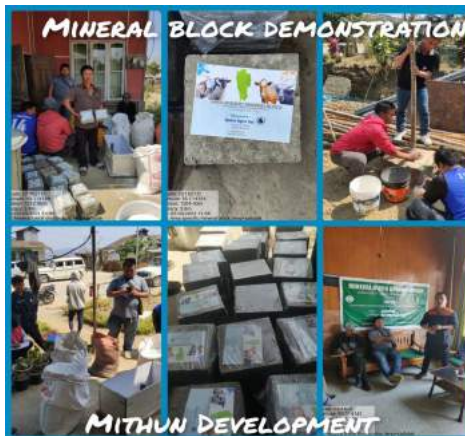
Hands on Training on Mineral Block Demonstration to Mithun Societies

FOCUS Officers and Staff meeting with Mithun Societies regarding the construction of Mithun Shelter, Water supply facilities, fencing of grazing areas and Mineral block demonstration which is a new technology in the state. The Mithun Development programme have been carried out by FOCUS Project in collaboration with AH & Vety Dept. and MGNREGA for the benefit of the Mithun Farmers.