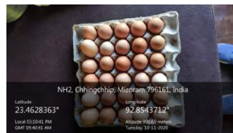
Eggs from the distributed Rainbow rooster birds