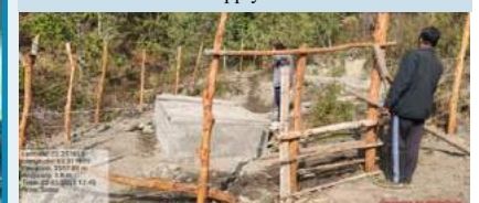
Water Supply Facilities