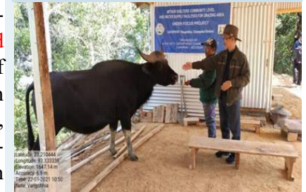
Water Supply Facilities

This activity is implemented in convergence between FOCUS Project and MNREGA. The cost of construction of fencing of grazing areas is shared between FOCUS project and MGNREGA, however, the construction of Mithun Shelter and Water Supply facilities will be provided on 50% subsidy to the identified Mithun Societies/FIG. Moreover, the Mineral Block Demonstration have been conducted by the project.