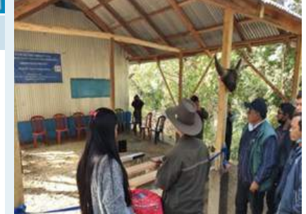
Inauguration of Newly Constructed Mithun Shelter at Village Level