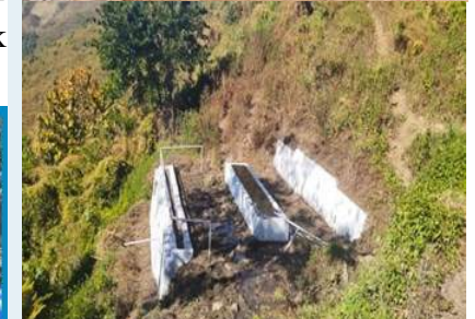
Water Supply Facilities

Demonstration have been conducted by the project.