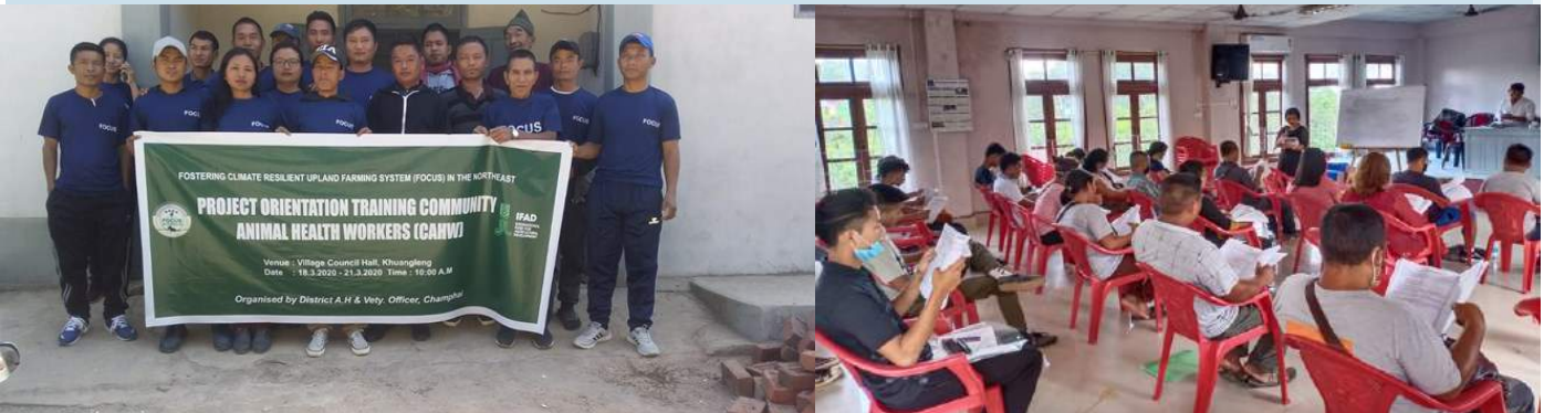
Training of CAHW on Veterinary first aid and basic animal husbandry practices