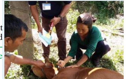
CAHW performing Vaccination on Cattle

This activity is implemented in convergence between FOCUS Project and Animal Husbandry & Veterinary Department. The activity is funded through CSS - FMD Control Programme, Classical Swine Fever Control Programme, ASCAD (Assistance to State for Control of Animal Diseases), Peste des Petits Ruminants Control Programme, Brucellosis Control Programme.