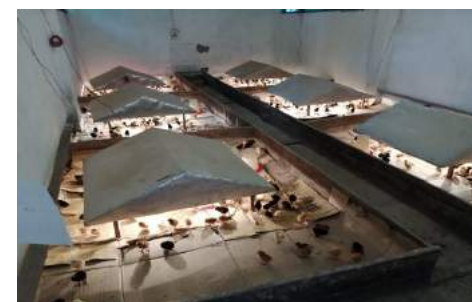
FOCUS Poultry Brooding Unit– Serchhip District