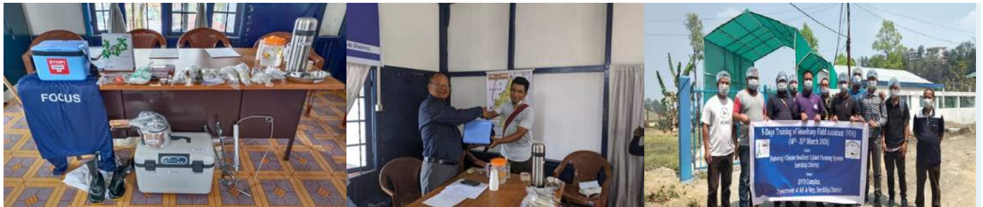
VFA training and Distribution of Cold Chain Equipment's & Veterinary first aid kits 16 th to 20 th March, 2020

The Community Animal Health Workers (CAHWs) were identified in each village covered under the project. All the CAHWs were trained with basic animal husbandry practices and were equipped with basic veterinary first aid kits. The CAHWs are expected to monitor the health of livestock in their village and act accordingly.