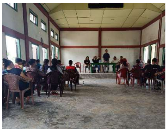
Pic: Formation of Ranggo FPC