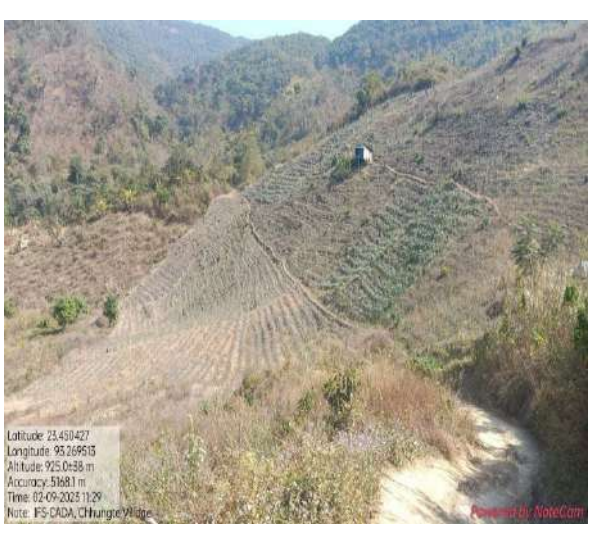
Chhungte, Champhai District