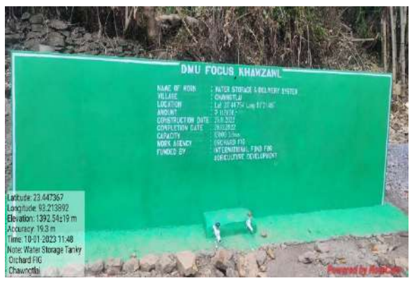
Water Storage & Delivery System