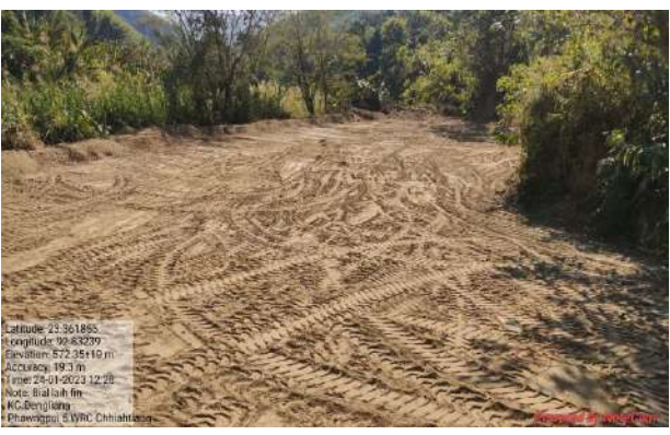
Chhiahtlang, Serchhip District