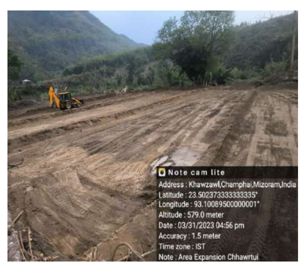
Chhawrhtui, Khawzawl District