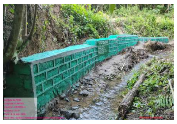
Stream Bank Erosion Control