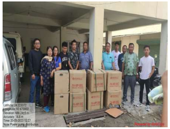
Distribution of Power Pump