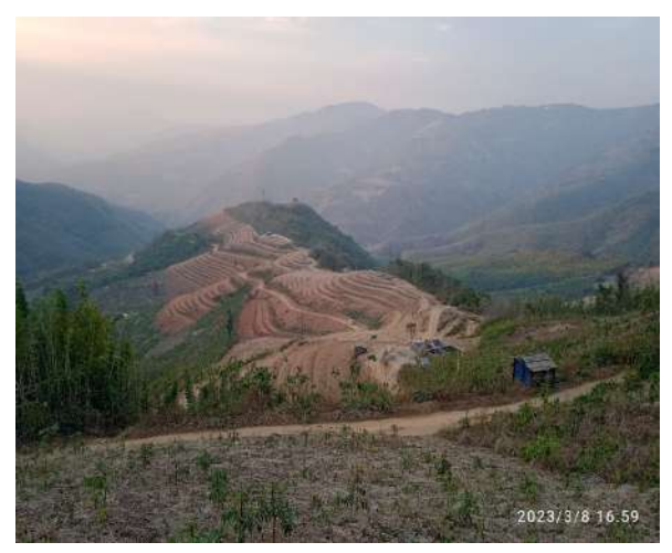
Sialsir, Serchhip District