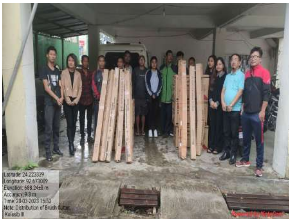
Distribution of Brush Cutter