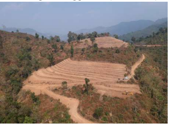
Lungchhuan, Serchhip District