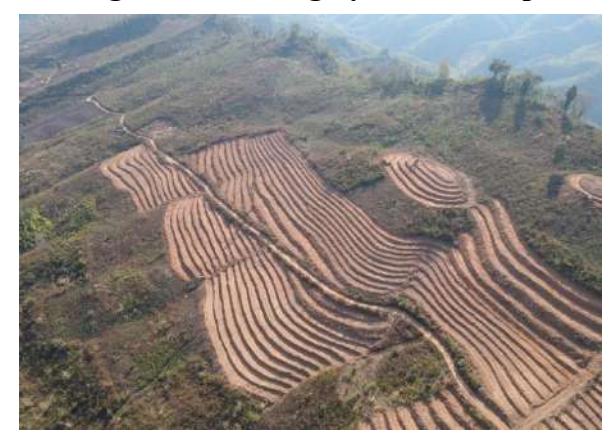
Hualtu, Serchhip District