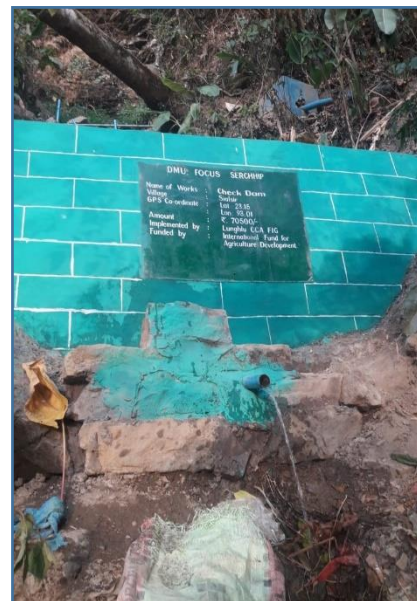
After construction Checkdam