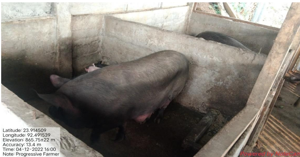
Fig: Achievements since Focus Intervention