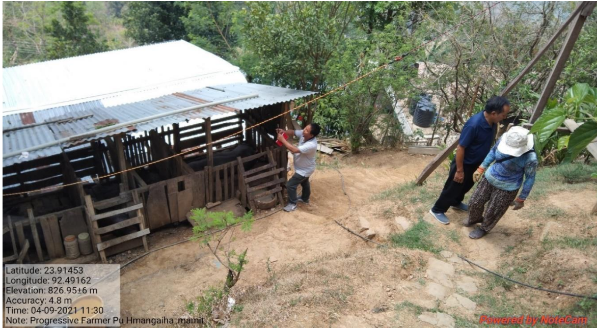
Pic: Old Pig Sty before Focus intervention