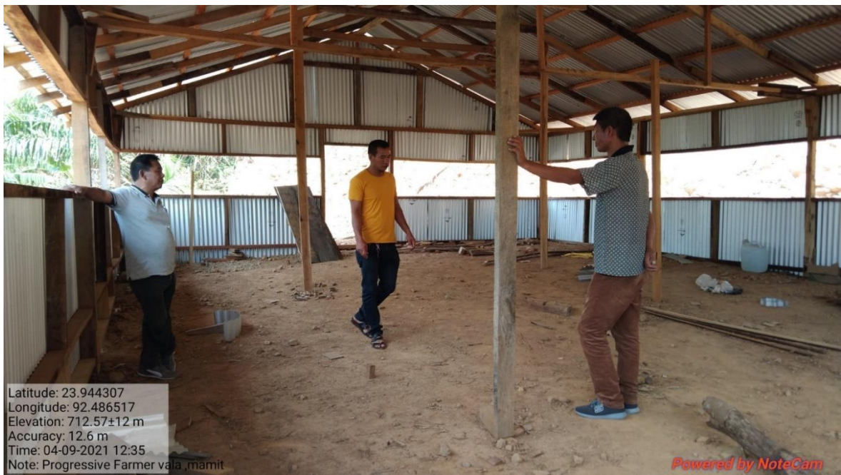
Pic: Progressive Farmer Visited by DVO & AHM ON 4.9.2021 Suggestion was given to beneficiaries regarding the housing design