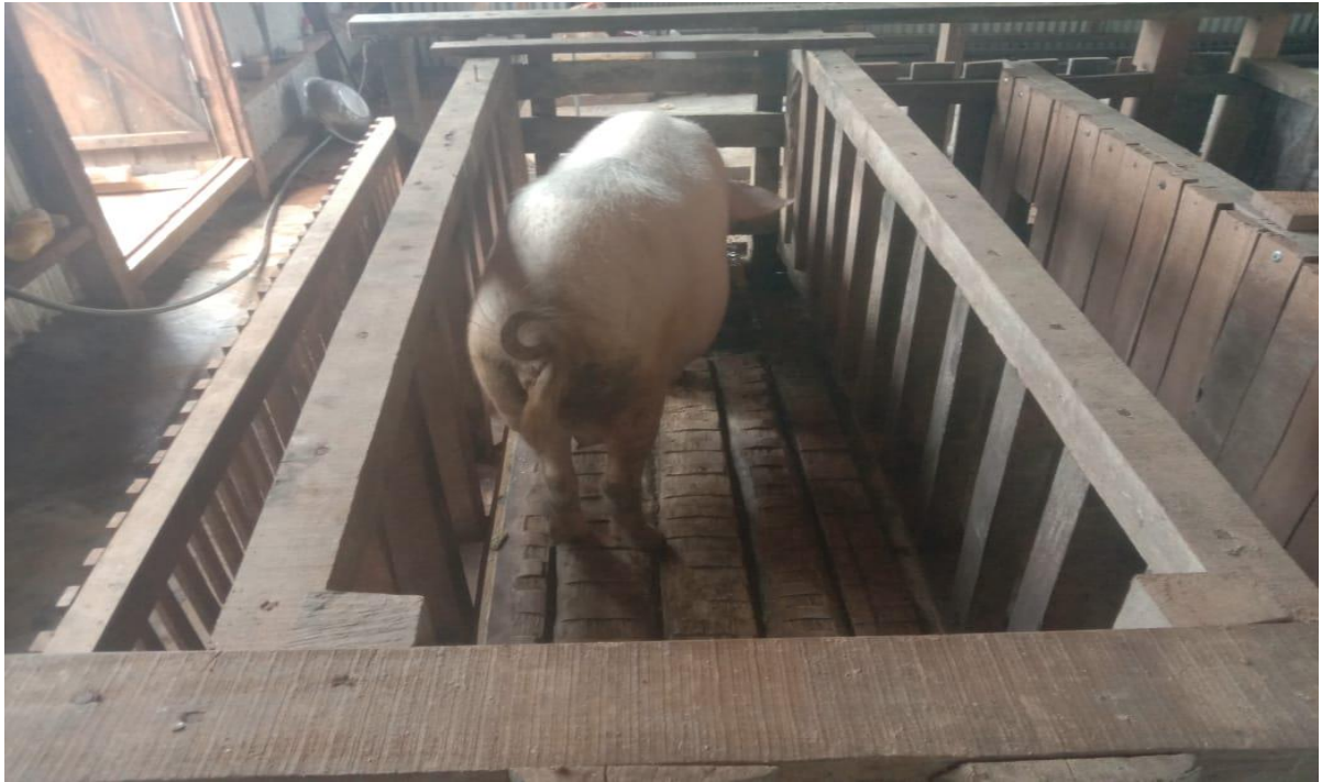
Pic: First sow reared in the Farm