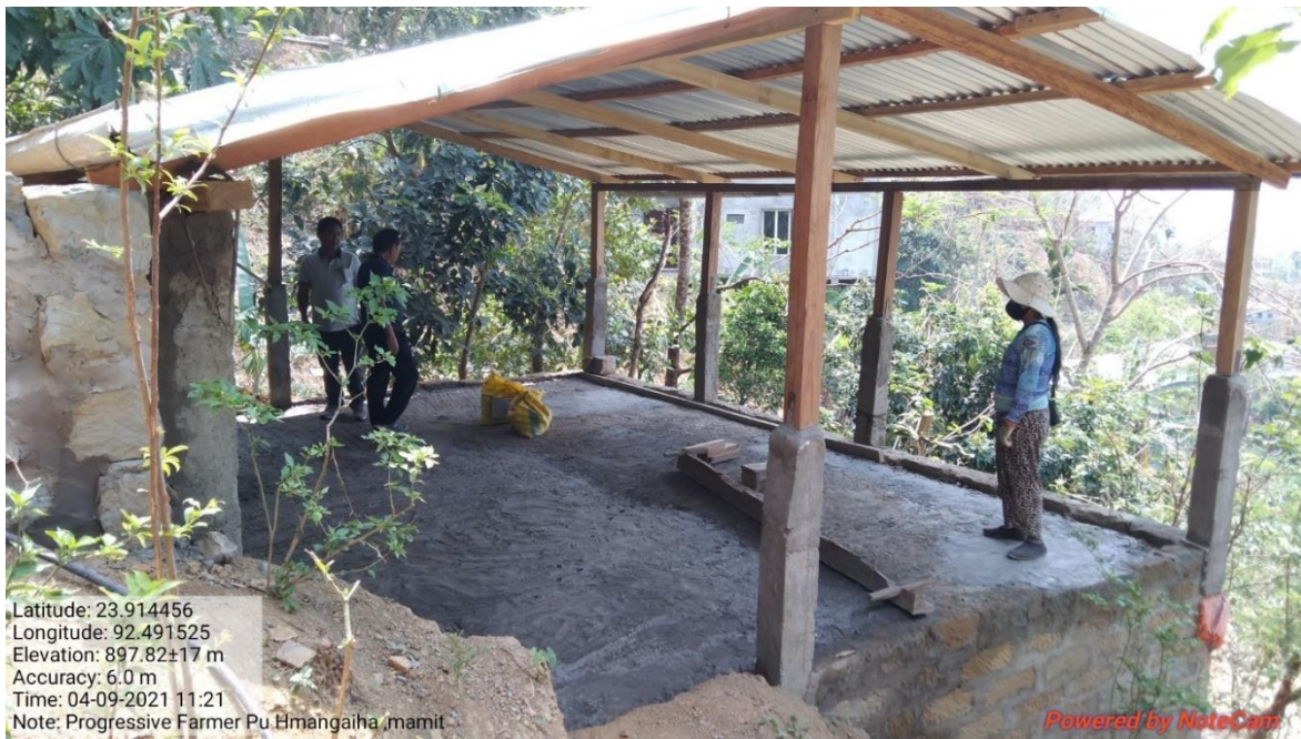
Pic: New Pig sty construction under Focus Project

Mr Lalhmangaiha Sailo completed his pig sty construction after release of sum amount Rs. 51,166.00 for 3 rd instalment on 7.10.2021. With this we have completed Release of funds for Pig Breeding Unit.