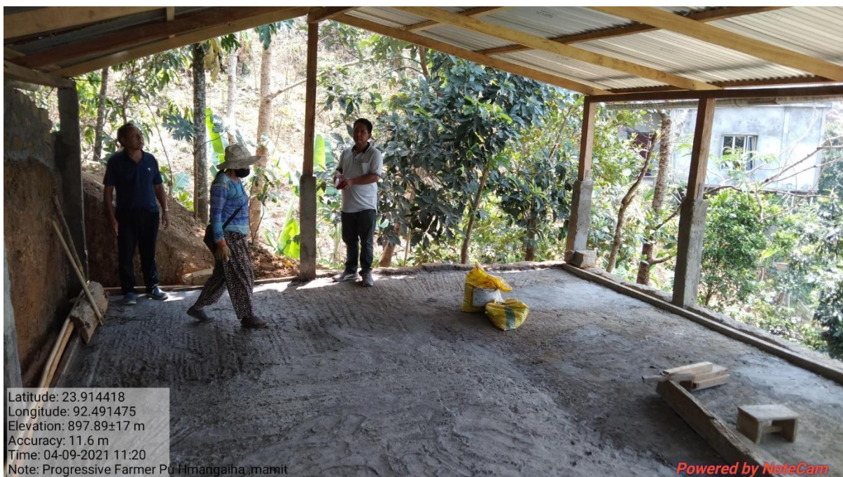
Pic: Pig Breeding Unit monitoring by DVO

Construction of Pig Housing was started on 7.3.2021 at Field Veng, Mausen road. Formerly, it was an empty land which was cleared for pig sty construction and earth work was done through convergence with MNREGA. The construction was done according to the detailed estimate for Construction of Pig Breeding Unit under FOCUS. Sum amount of Rs. 51167/- was released for 1 st Instalment for pig breeding unit on 11.2.2021.