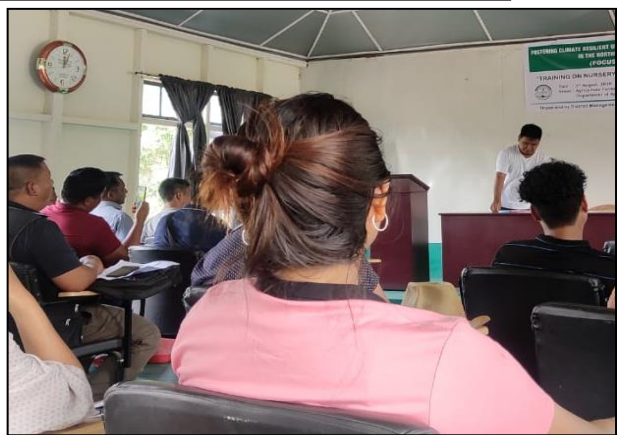
Fig: Training on nursery establishment