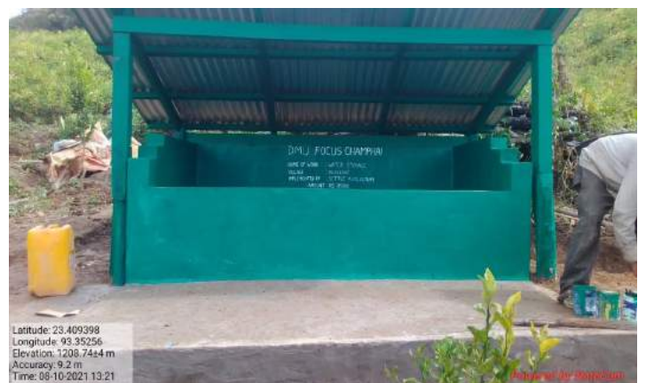
Water storage and delivery system, Mualkawi Village Champhai District