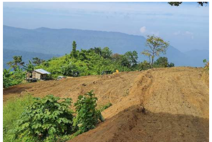
Bench Terracing, Hmawngkawn