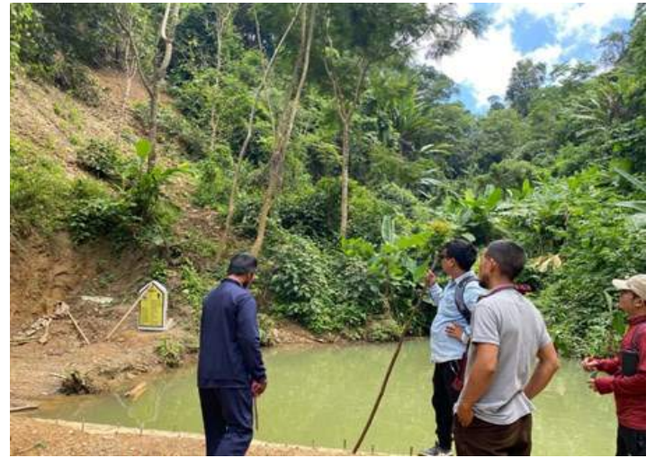
Site Verification for Construction of Check Dam at Zote South & Kanghai South Villages, Serchhip District