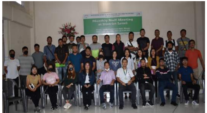
Mamit District (29th October, 2021)