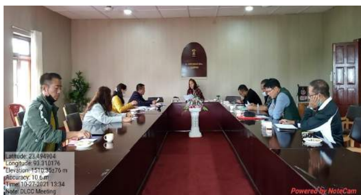
Champhai DLCC on 27 th October, 2021