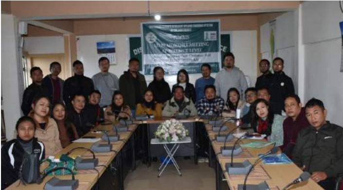
Champhai District (14th December, 2021)