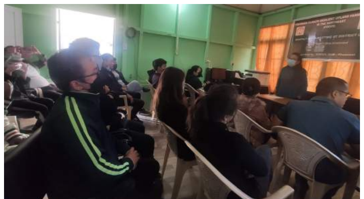
Khawzawl District (3rd December, 2021)