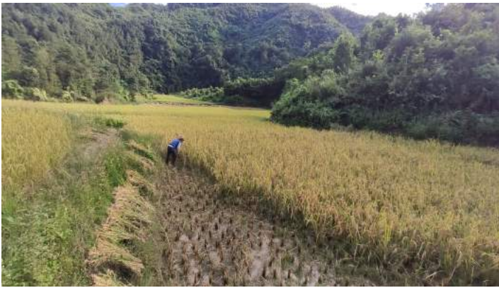
Harvesting RCM 13