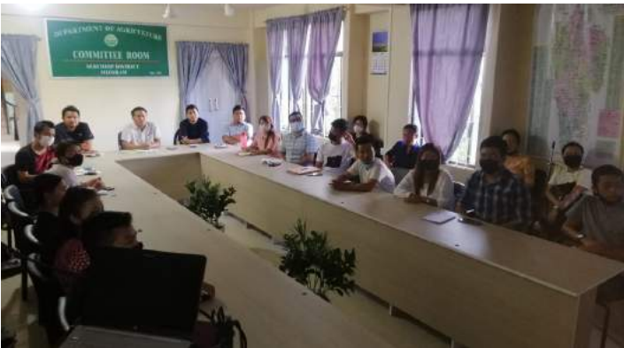
Serchhip District (1 st October, 2021)