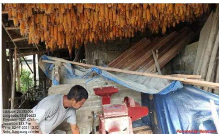
Convergence: FOCUS & Agri. Dept. on Maize Production and its Value Addition at Village level, Bungzung and Sialhawk Villages, Champhai District