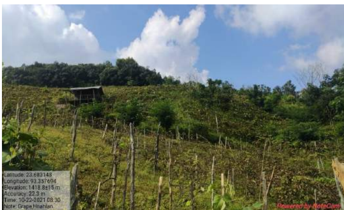
Rejuvenation of Grape, Hnahlan Village Champhai District