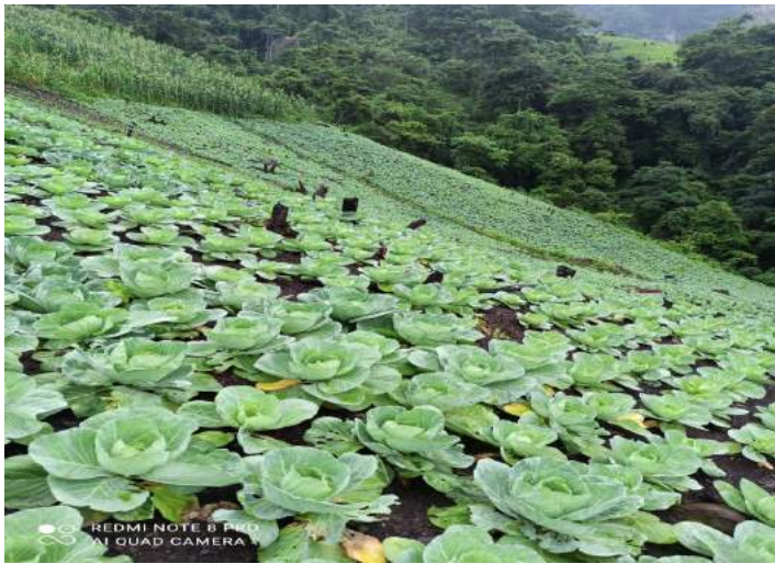
Cabbage Cultivation, Khankawn Village, Saitual District