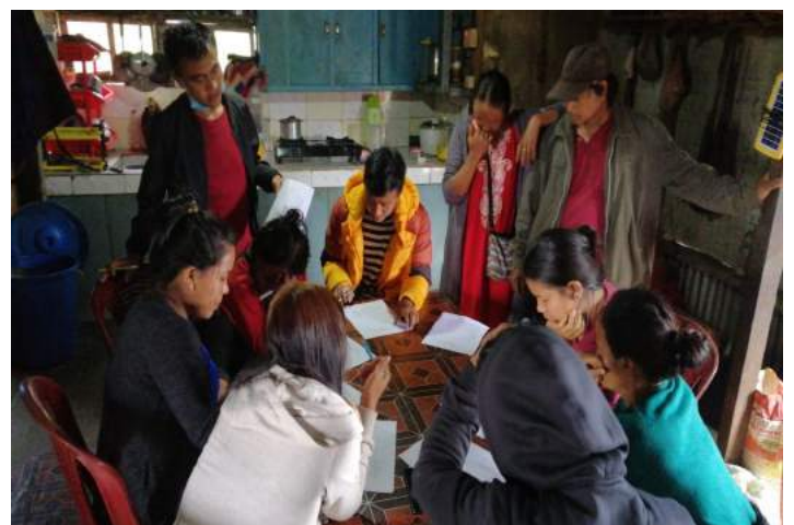
Annual Outcome Survey, Lungkawlh