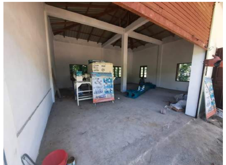
Mission Director visit the installation of Composite Feed Mill at Serchhip, Serchhip District