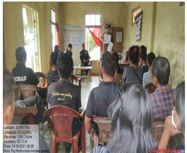
Meeting with WRC FIGS Construction of Water Canal, Serchhip District