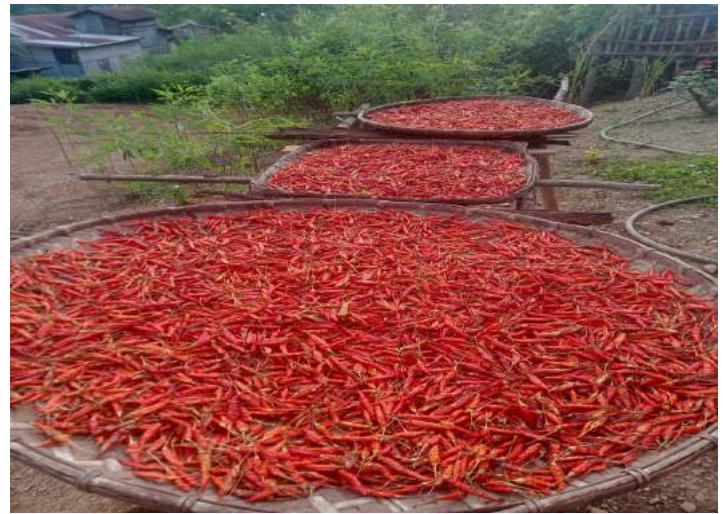
Value Chain - Chilli Cultivation, Hruaikawn Village, Champhai District