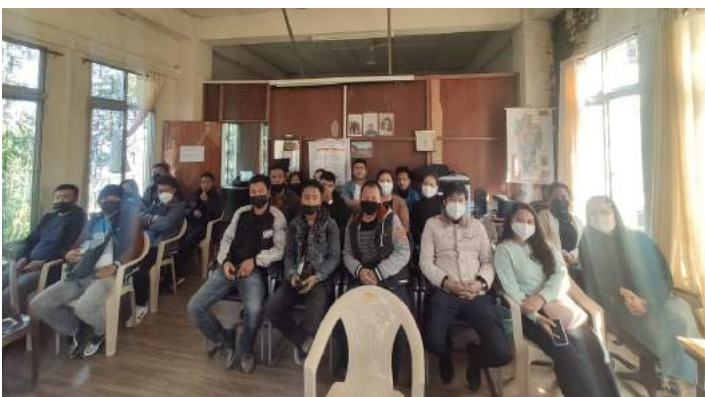
Saitual District (14th December, 2021)