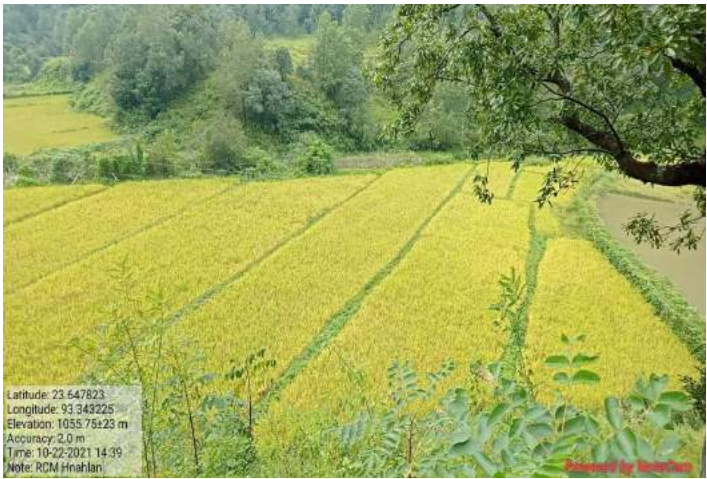
Latitude: 23.647823 Longitude: 93.343225 Elevation: 1035.7523 m Accuracy: 2.0 m Time: 10-22-2021 14:39 Note: RCM Hnahlan